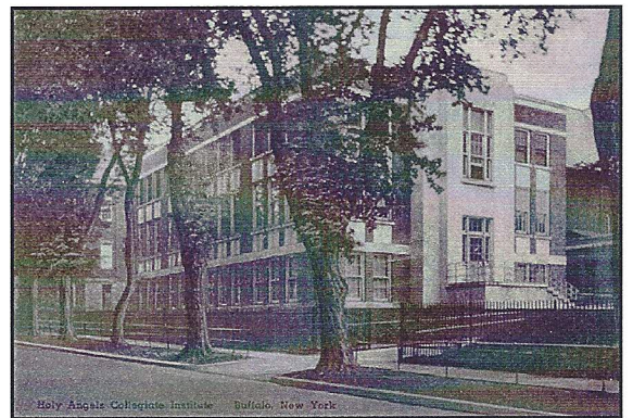
Holy Angels Collegiate Institute